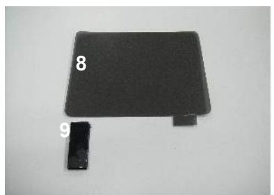
8.. Sticker 9. Adhesive Band